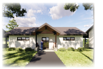
Artist's rendering of a new cabin.

programming leading up to summer camp 2024.