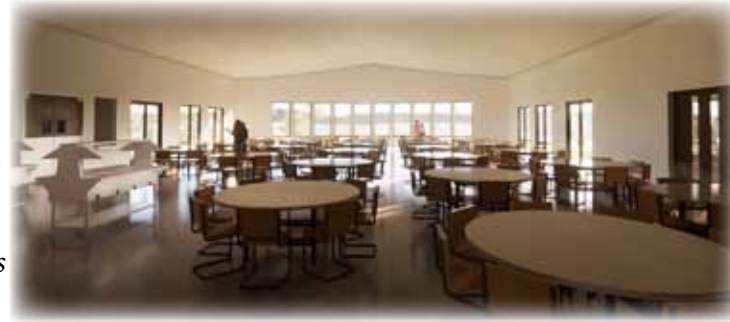
New Dining Hall

Construction will officially begin on this project in March 2022. Our goal is to be roughed in (concrete, framing, roof and windows and doors) by November/December of 2022. To accomplish this financially, we still need to raise approximately $150,000 in the next year.