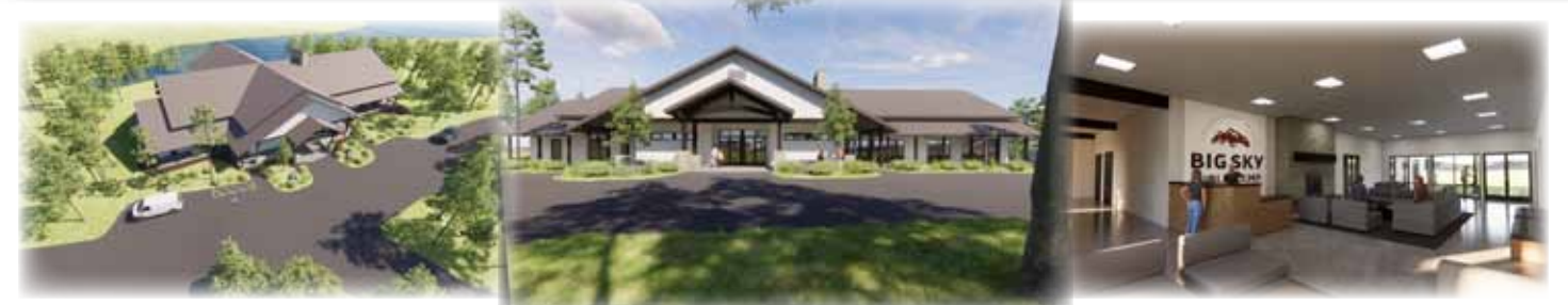
New Dining Hall Pics